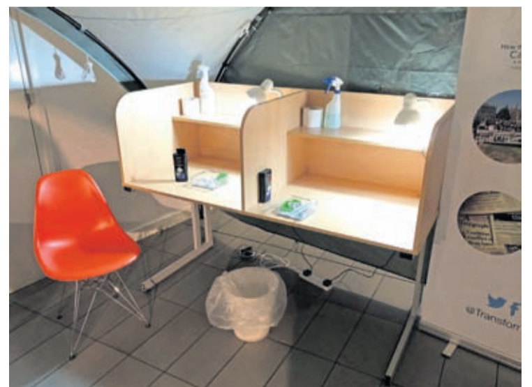
A view of a mock drugs consumption room - where users take heroin under medical supervision - staged at Colston Hall in Bristol, Jan. 24, 2020.